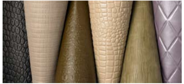
Shown (L-R): Quill, Basket, Turtle, Florida Gator, Bark, and Large Diamond.

Garrett's Impress patterns are produced using a combination of heat and pressure to emboss specific patterns on finished leather. Over 30 patterns are available on more than 400 colors, in half hide increments. Lead time for all Impress orders is two weeks from the receipt of the confirmed purchase order and applicable deposit.