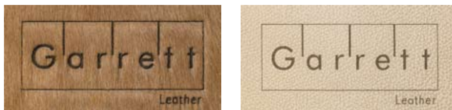
Shown (L-R): Laser embossing on Natural Steerhide, laser embossing on Mystique Cashmere.

Laser embossing creates beautiful patterns on leather using heat and computerized lasers. Send your artwork with actual dimensions to Garrett for a price quote. Upon request, a sample with your design will be provided for a small fee. Once approved, your order will begin production. Please allow three weeks for delivery.