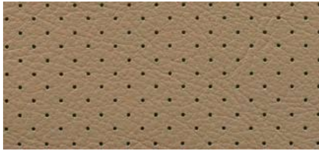
Shown: Hampton pattern.

Perforating may be done in 11 different patterns on any type of Garrett leather, with the exception of Wovens, Steer-hides, and Sheepskin. Garrett will perforate any customer supplied leather as well. All perforating is done in half hide increments with a ten-day lead-time.