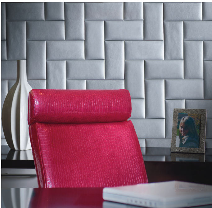
Pearlescence Silver Wall Panel