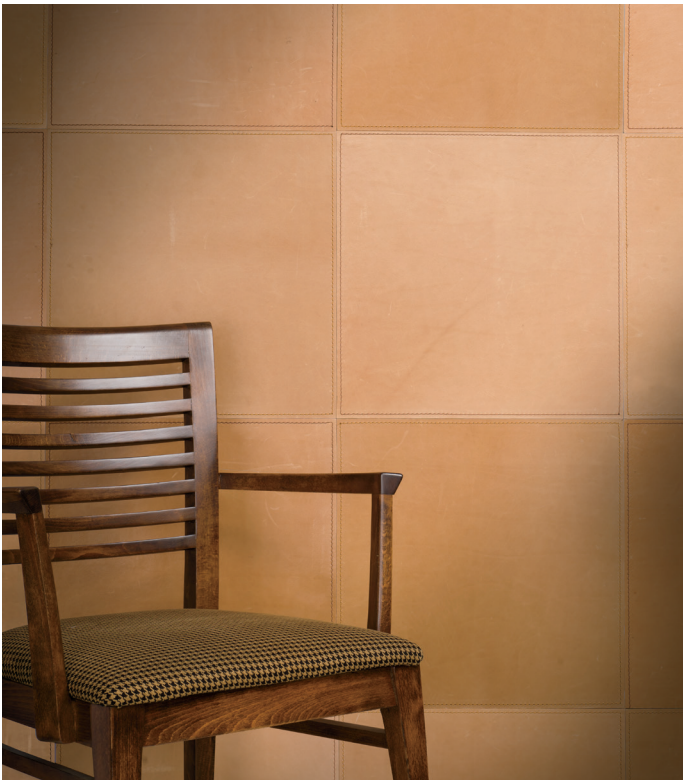
Vintage Buckskin Wall Tile