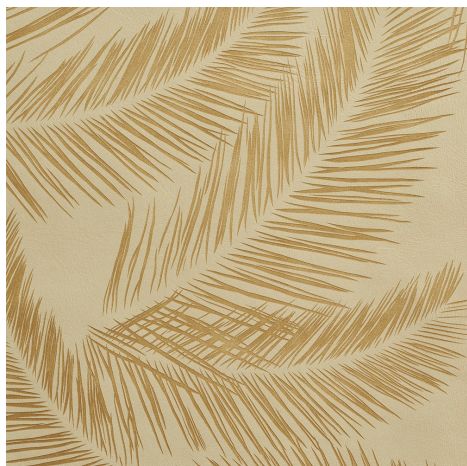
NNFR027 Fronds Apache