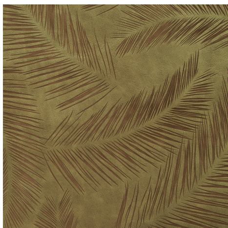
NNFR9075 Fronds Fennel