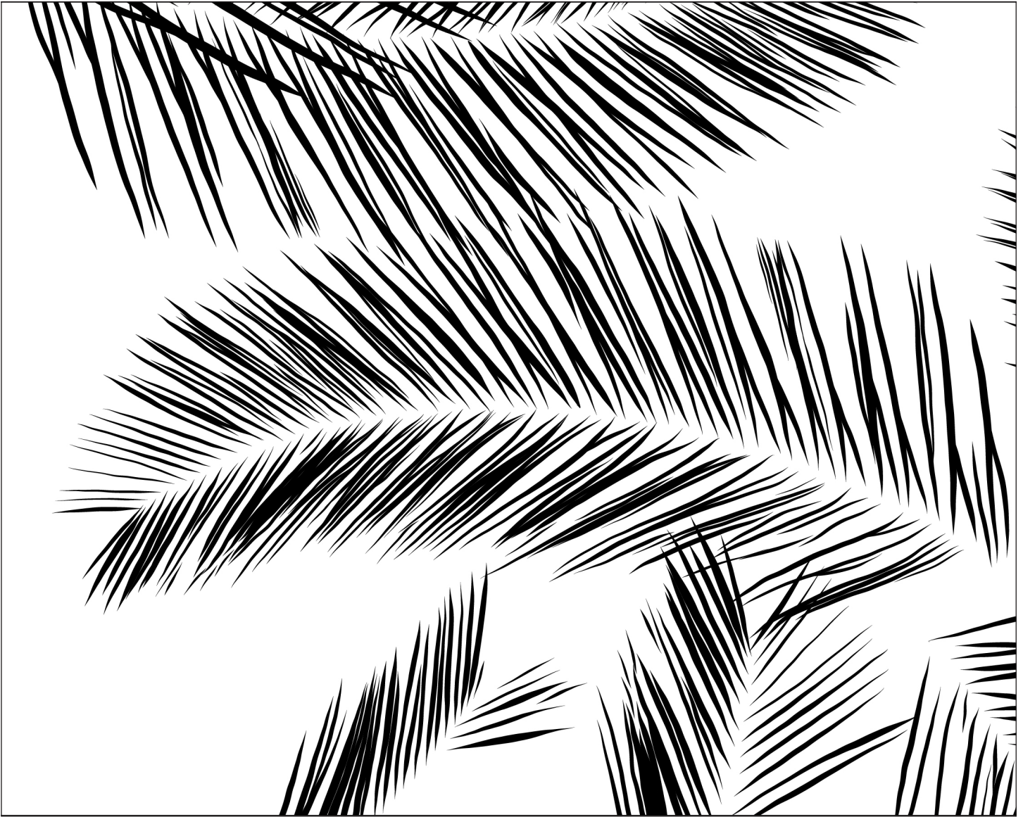
Fronds pattern at 100% of actual size.