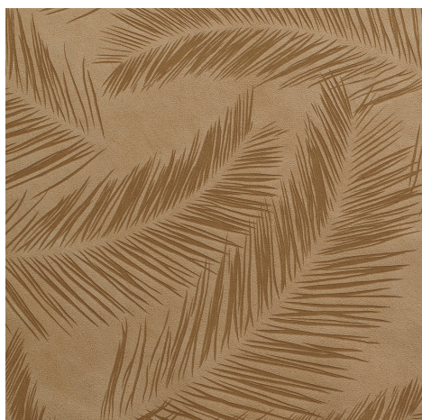
NNFR9001 Fronds Irish Cream