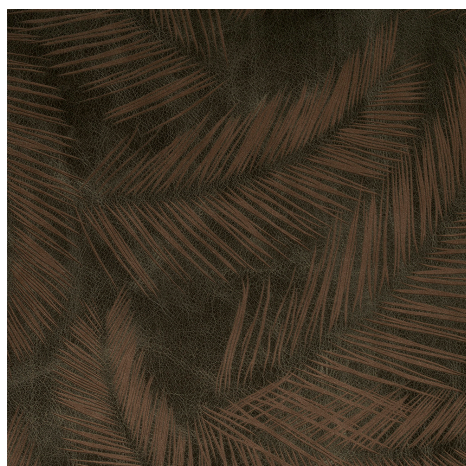
NNFR9052 Fronds Anthracite