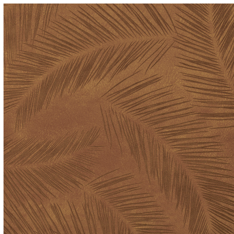
NNFR084 Fronds Mohican