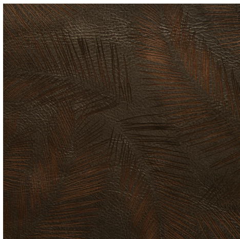
NNFR050 Fronds Blackfoot